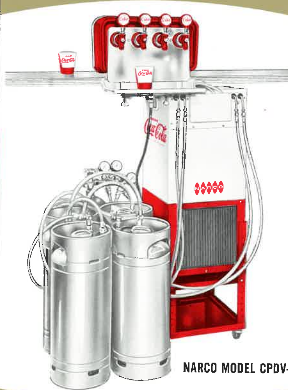
NARCO MODEL CPDV-C4 INSTALLED