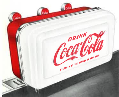
NARCO Model CPDV-C3